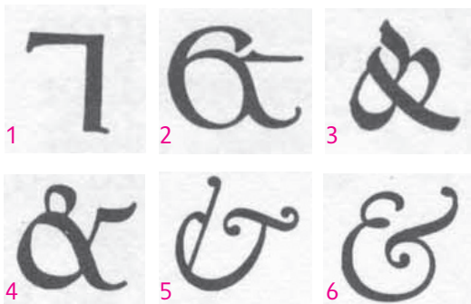
Some samples drawn by Goudy to illustrate the evolution of the ampersand. 1) Tironian abbreviation from 1st Century B.C. 2) & from the 7th Century Book of Kells, 3) & from a 12th Century manuscript, 4) & from an Italian printer in 1498, 5) & designed by Garamond 1540, 6) & designed by Plantin in 1583.

Ands & Ampersands is a remarkable little book and offers a seldom considered perspective on the origins of a letterform whose evolution continues even today.